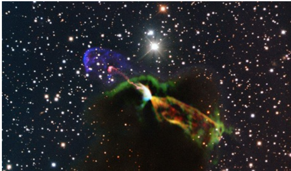
As stars form in clouds of gas and dust, they shoot powerful jets of gas and other raw material outward, known as stellar outflows.

Héctor's path is unique; astronomers today tend to focus on the object of study rather than the means of studying it. But Héctor Arce is a radio astronomer, and always intended to be. "I don't think that term is used nowadays," Héctor muses. "Typically, now, people don't say 'you're an optical astronomer' or 'you're a radio astronomer' or whatever you use. You investigate the topic, the phenomena. But certain phenomena are easier to observe with radio or optical signals. In star formation, you're looking at obscure regions, so optical light is not the best signal to use. So I concentrated on electromagnetic signals with long wavelengths, from infrared to radio waves [8]." Héctor's path was first influenced by the Arecibo telescope, and then directed to the phenomena that it could elucidate. "Now I study stellar outflows," he says, the flow of gas that is emitted from a newly created star. Studying outflows helps us understand how stars form and how they impact, in physical and chemical ways, the gas clouds where they are born.