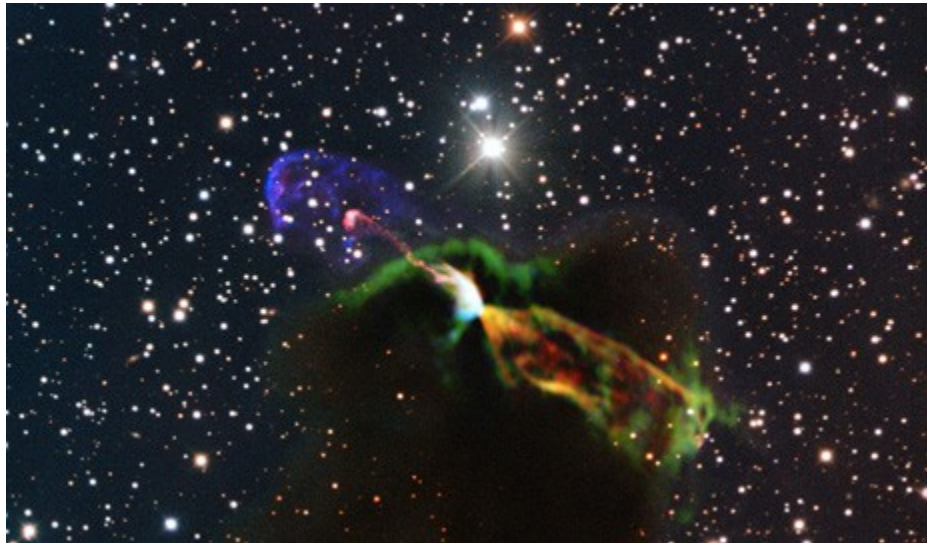
As stars form in clouds of gas and dust, they shoot powerful jets of gas and other raw material outward, known as stellar outflows.