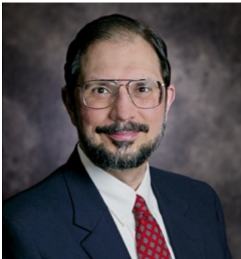
Former Dr. Taylor's graduate student, Russell Hulse, performed his work at the Arecibo Radiotelescope and discovered the first binary pulsar.

On January 15, 1975, they published in “Astrophysical Journal” their account of PSR 1913+16 [6], the first observation of a binary pulsar [7]. In 1993, Dr. Hulse and Dr. Taylor won the Nobel Prize in Physics [8] for their discovery, which had turned out to have enormous implications for astrophysics and the theory of general relativity. This was also one of the first Nobel Prizes with a Puerto Rican connection.