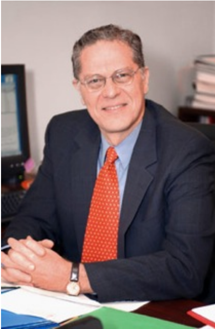
Dr. Joseph Taylor

CienciaPR: How did you become interested in science? In astrophysics? In pulsars?