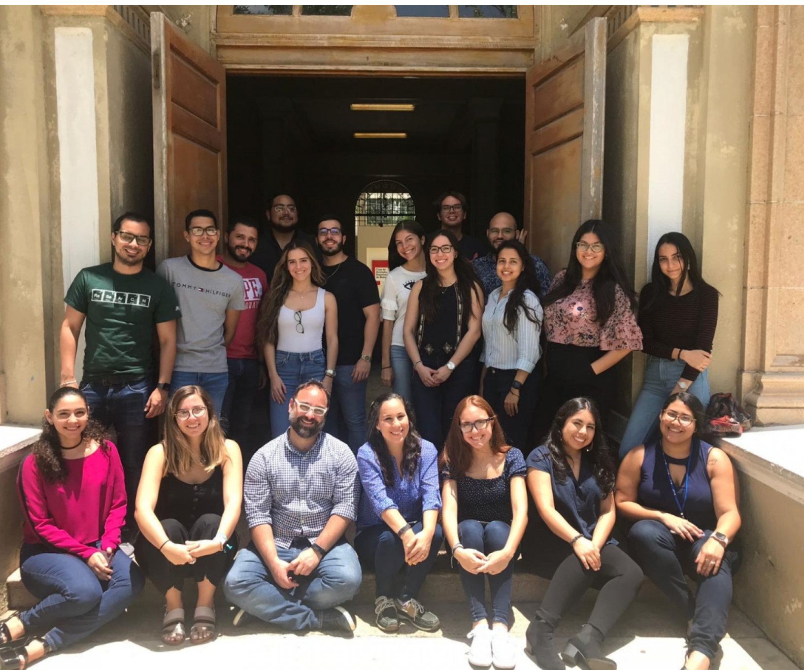
Group picture of the JARM Lab at UPR-RP.

The first project focuses on proteins that are necessary for heart development. Sometimes these proteins do not work properly, resulting in congenital cardiopathies or heart defects at birth. This project consists of answering the following question: What happens to these proteins when they do not function properly? The answer could be found in how these proteins interact with DNA.