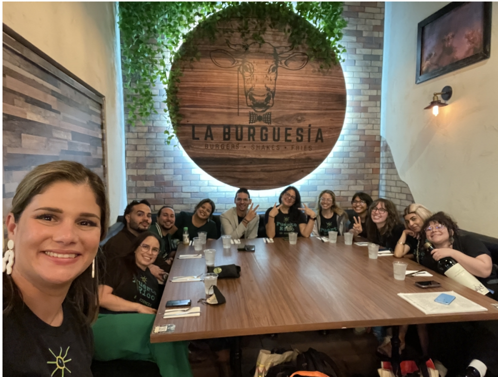
CienciaPR team relaxing after a long day!

The booth provided us with a very cherished opportunity to greet and connect with so many collaborators, allies, mentors, and students who have passed through our organization or programs. Past volunteers and members of the CienciaPR "Equipo", Yale Ciencia Academy fellows, mentors and alumni of Seeds of Success, speakers in our Ciencia al Servicio program, YOU are a wave that will lead science to a new reality of inclusion, impact and service. It was great to see many of you at the conference. How I wish I could have had more time to hug and talk with everyone.