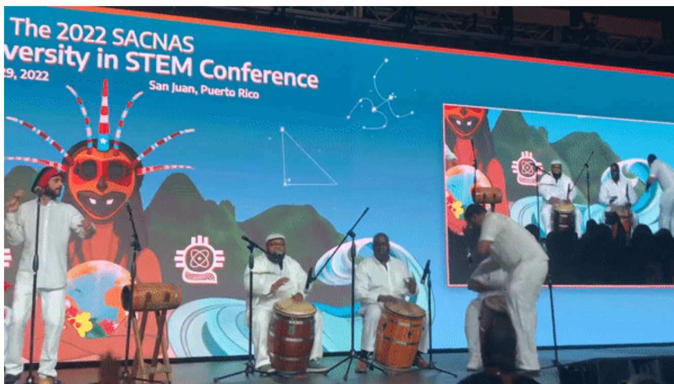
AFROLegado playing bomba at SACNAS2022.

Our #CienciaBoricua made its presence known [10] the rest of the conference. The program was marked by countless presentations led by scientists from our community and the participation of many new to science. It was our mission to celebrate and make these contributions visible. We hope you all felt the deep appreciation and admiration we have for all your achievements and contributions.