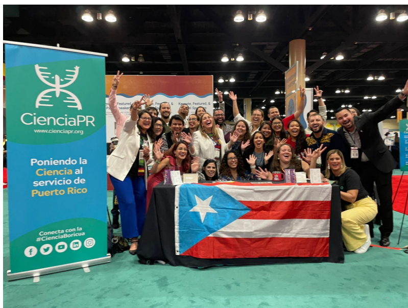
The Yale Ciencia Academy family at SACNAS.