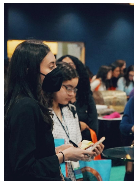
Mentors of Seeds of Success at SACNAS 2022.

If this is your first time reading us: Welcome! We hope that SACNAS was an opportunity to meet other members of our #CienciaBorica and see yourselves reflected in this vibrant community that is here for you and by you. We know this will be the beginning of a beautiful and long trajectory of putting science in the service of Puerto Rico.