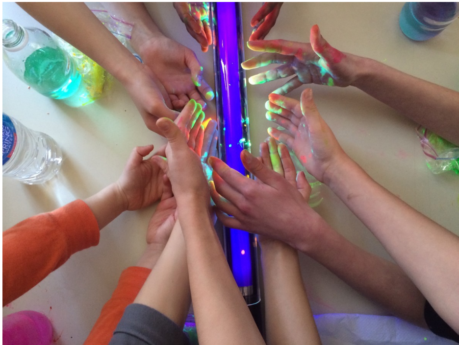
Our Experiments in Science and Engineering