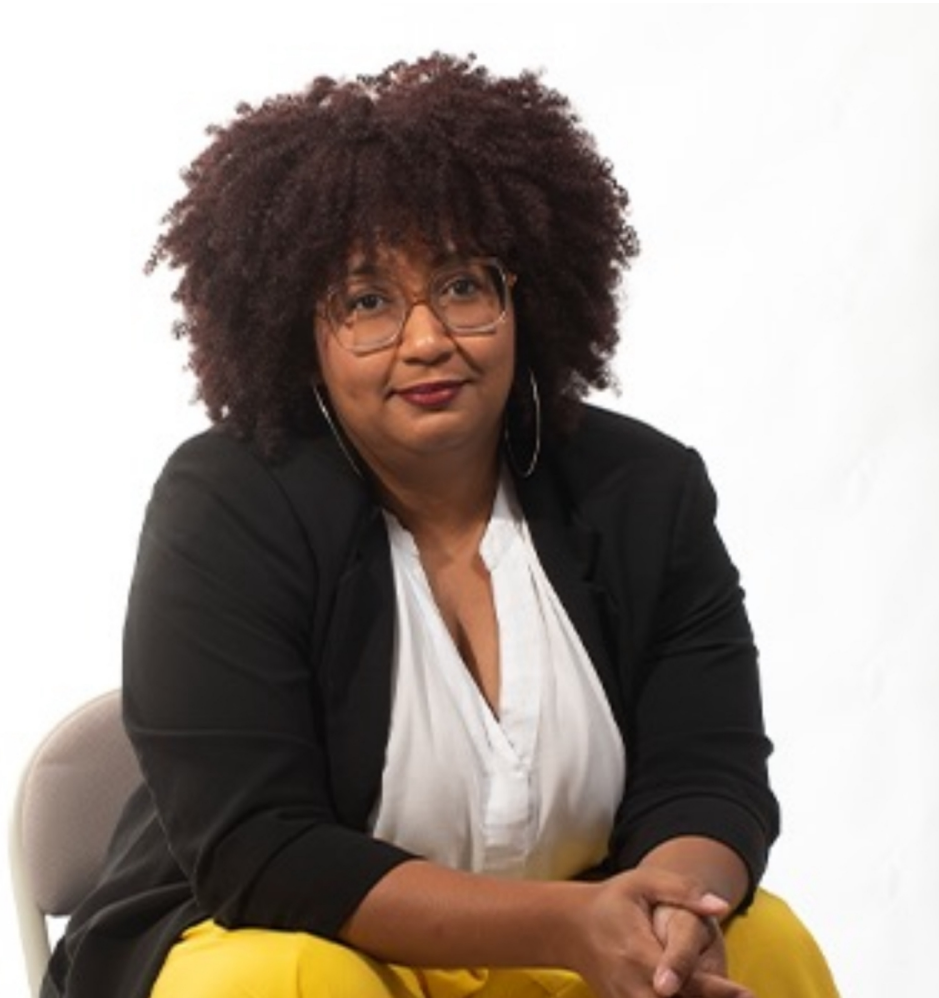
Natasha DeLeon Rodriguez

You can read the full note here: https://www.aaas.org/membership/member-spotlight/puerto-rico-lsen-liaison-natasha-deleon-rodriguez-sews-network-problem [14]