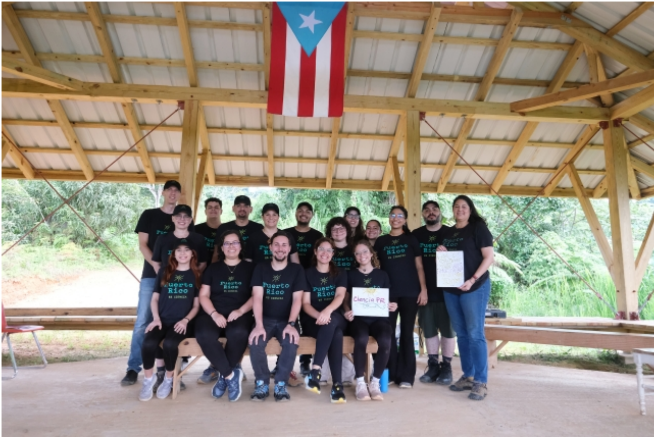
The CienciaPR team at a retreat in Finca Tabonuco, Adjuntas