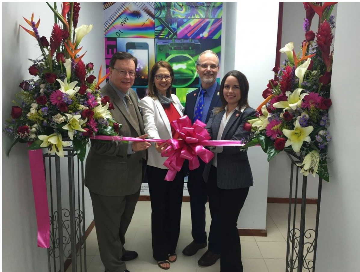
Inauguration of the Institute of Photonics.