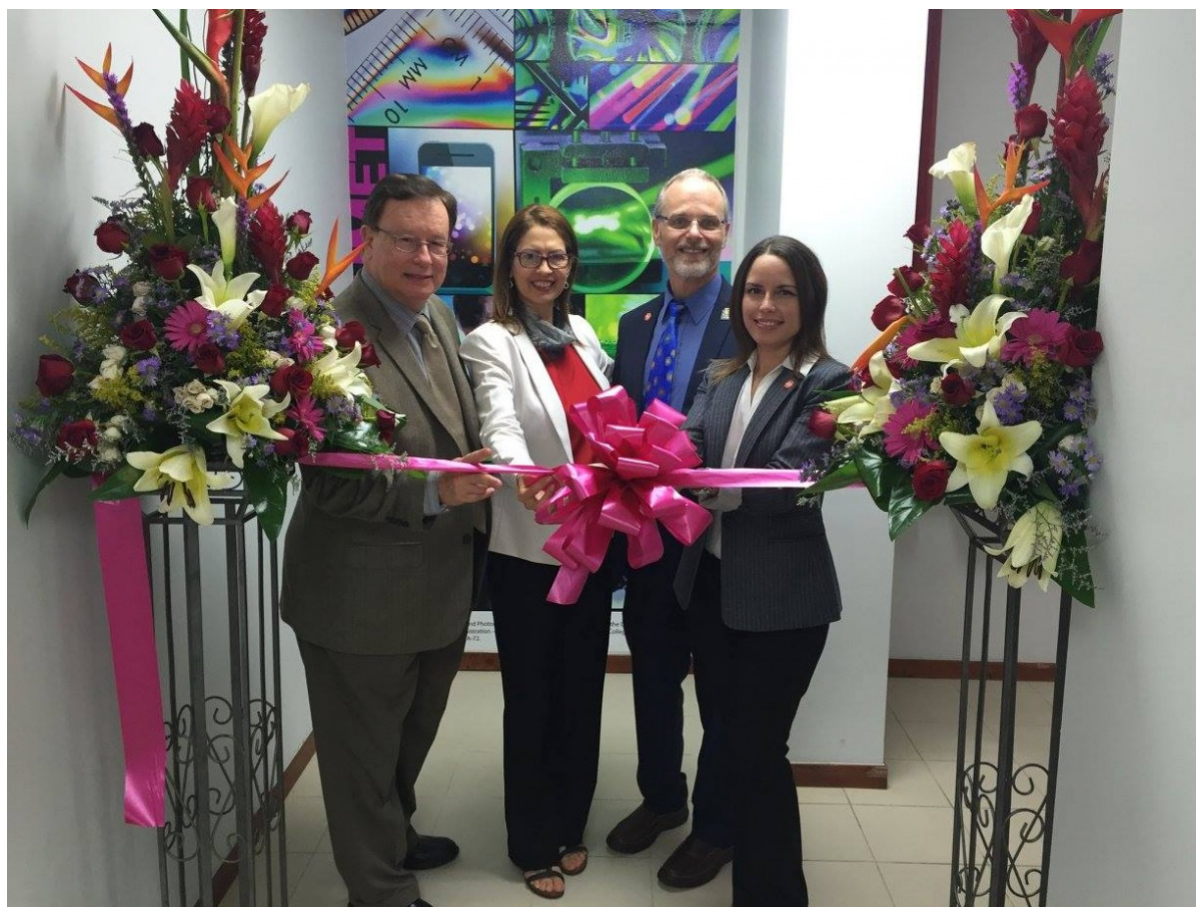
Inauguration of the Institue of Photonics.