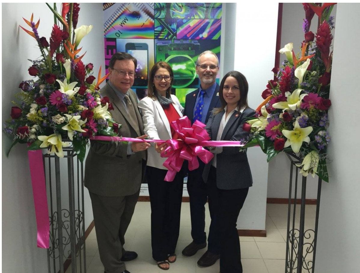
Inauguration of the Institue of Photonics.