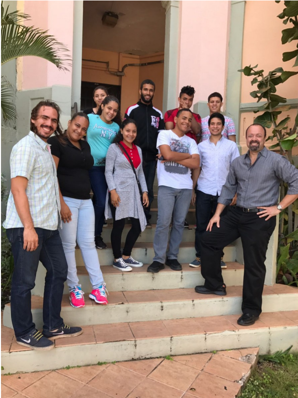
Students from the Juana Matos community in Cataño interested in science visiting the Institute of Neurobiology.