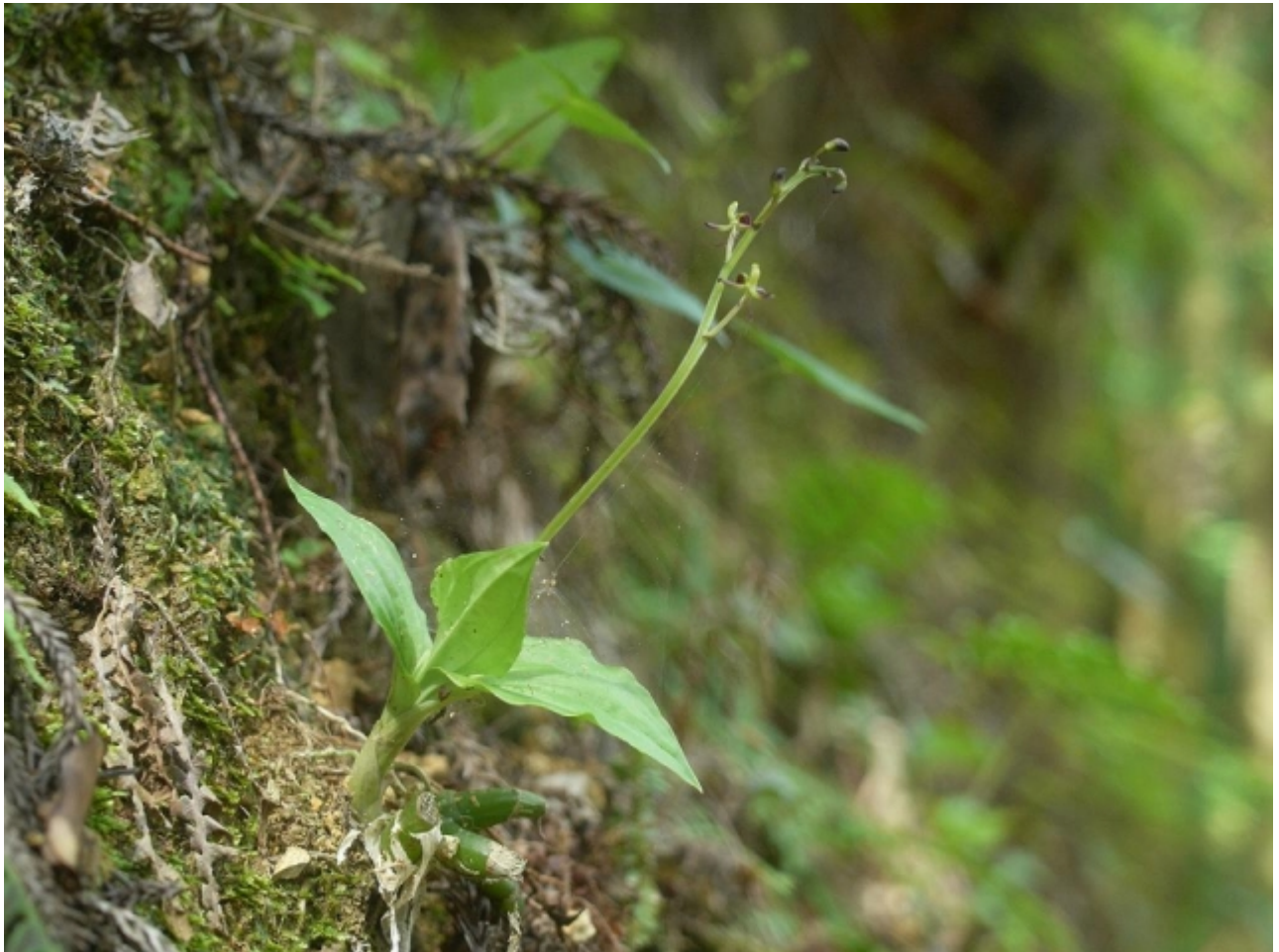
Liparis nervosa