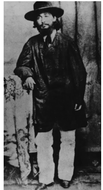
The young doctor, researcher, and future Puerto Rican patriot, Ramón Emeterio Betances