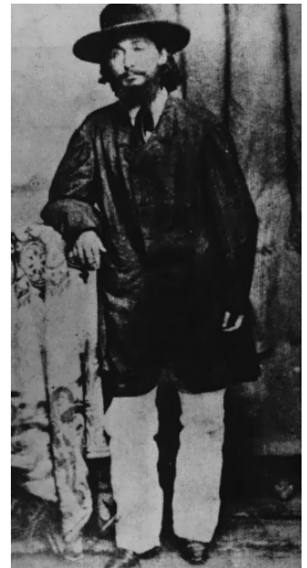
The young doctor, researcher, and future Puerto Rican patriot, Ramón Emeterio Betances