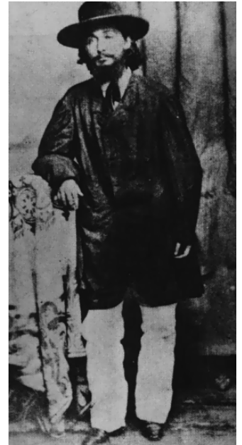
The young doctor, researcher, and future Puerto Rican patriot, Ramón Emeterio Betances