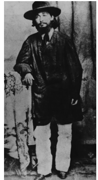
The young doctor, researcher, and future Puerto Rican patriot, Ramón Emeterio Betances