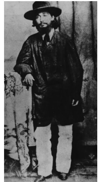
The young doctor, researcher, and future Puerto Rican patriot, Ramón Emeterio Betances