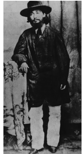
The young doctor, researcher, and future Puerto Rican patriot, Ramón Emeterio Betances