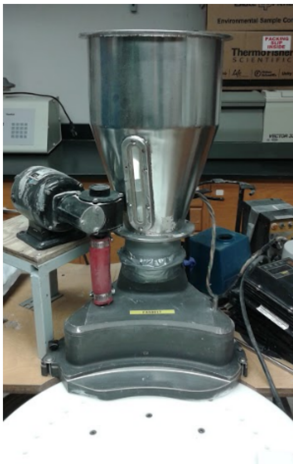
Figure 1. Set-up used in the experiments. Figure 2. Spectra at paddle wheel speeds of 36.7, 33.5, 30.5, 27.4, 24.8 rpm.?

I can only describe this summer with one word, exhausting. I never thought I would stand at one point of my life and say, "I really want this summer to end". Now don't get me wrong, this summer has been one of the most enriching summers of my life. In two months, I've learned much more than I will ever learn in a classroom an entire semester. I am passionate about research, and my heart skips a beat every time I enter a lab. Most certainly, I would not feel as happy and eager to