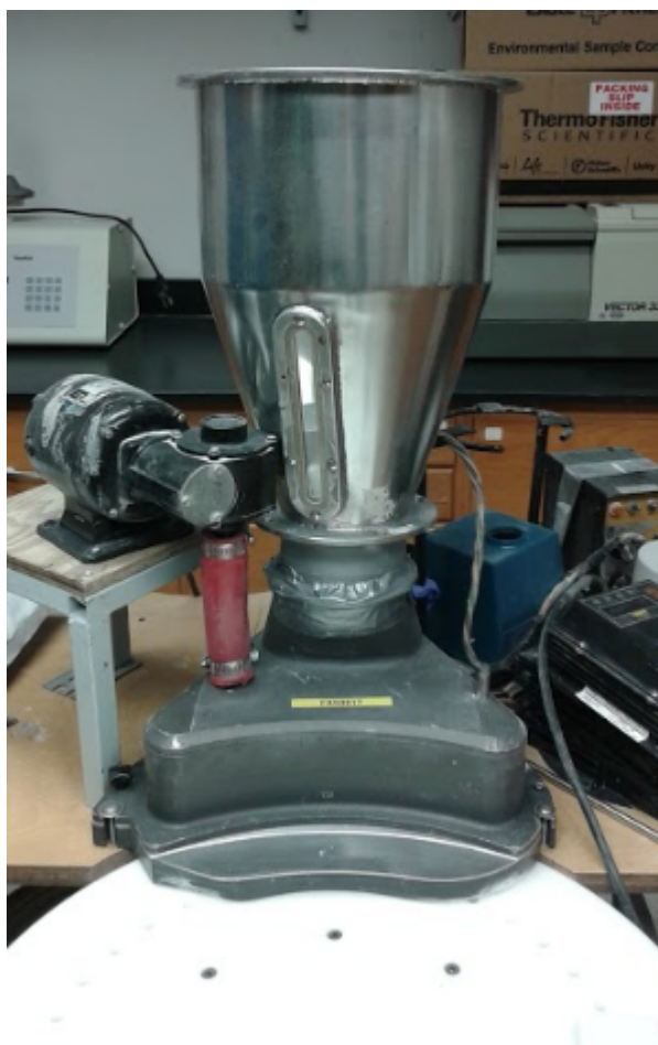
Figure 1. Set-up used in the experiments. Figure 2. Spectra at paddle wheel speeds of 36.7, 33.5, 30.5, 27.4, 24.8 rpm.

I can only describe this summer with one word, exhausting. I never thought I would stand at one point of my life and say, "I really want this summer to end". Now don't get me wrong, this summer has been one of the most enriching summers of my life. In two months, I've learned much more than I will ever learn in a classroom an entire semester. I am passionate about research, and my