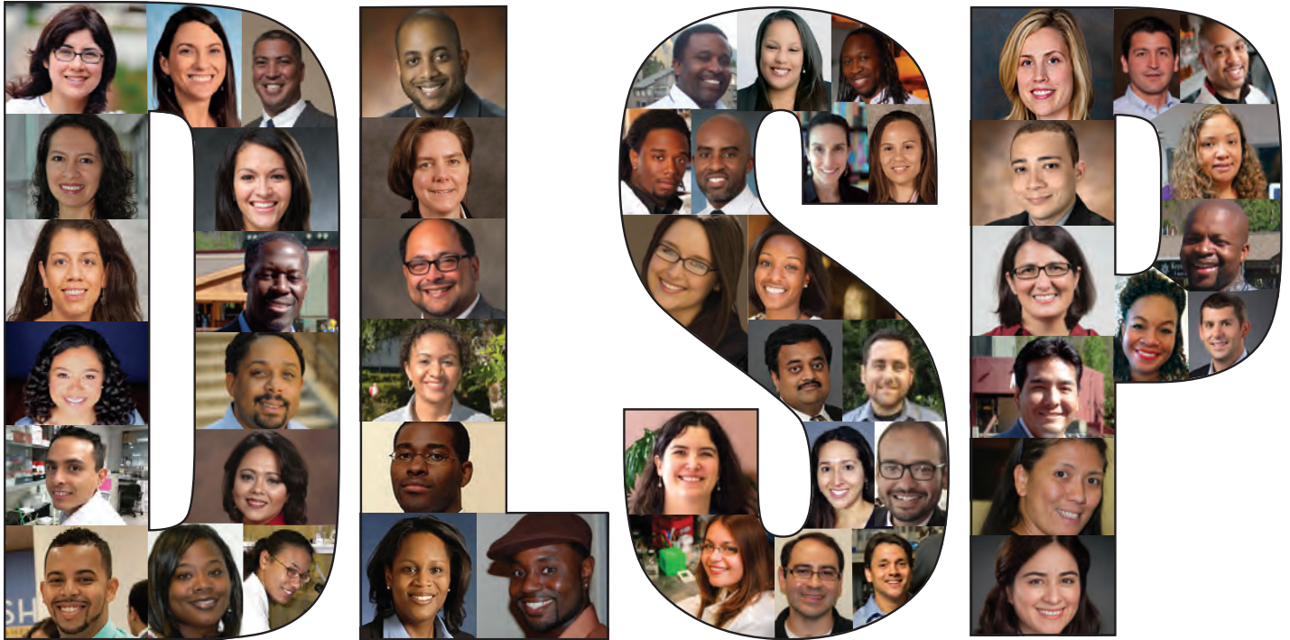
Keystone Symposia Fellows, 2008-2017

Call for applications for the 2018 Keystone Symposia Fellows Program!