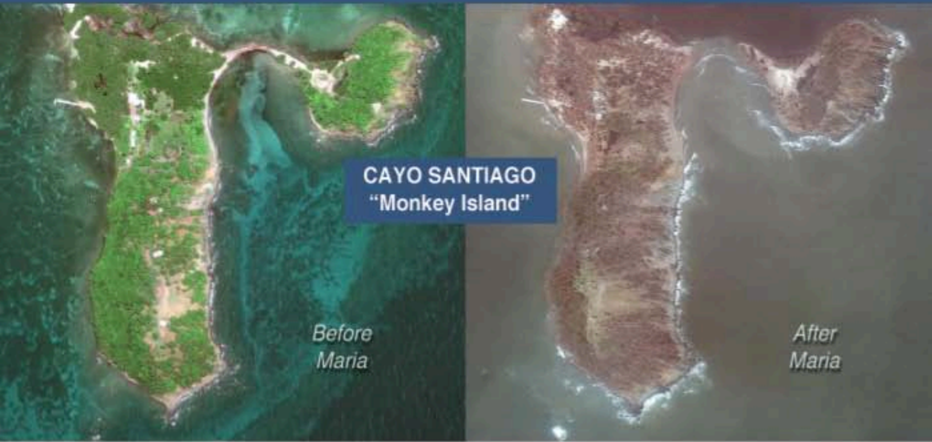
CAYO SANTIAGO "Monkey Island"

The 155-190 mph winds were constant for over 16 hours Punta Santiago - and "Monkey Island" - were completely torn apart.